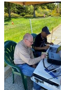
President Ralph-KC6YDH & Bharat-W2OKB Operating on 20 meters

11 – Club Members of which 6 Operated 03 – Visitors (+ #?? Didn't Sign-in, just stopped by)