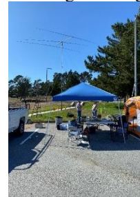
2025 FD Welcome/GOTA Table